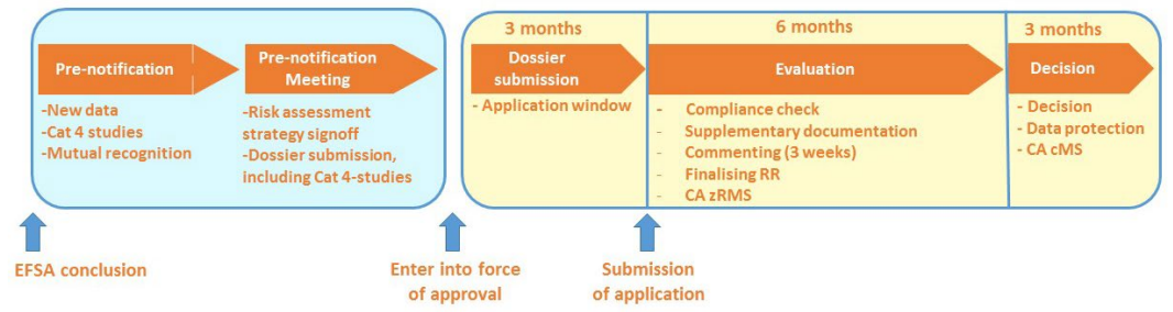
Figure 1 Scheme of the process for re-authorisations

A scheme of the process is given in Figure 1 Scheme of the process for reauthorisations.