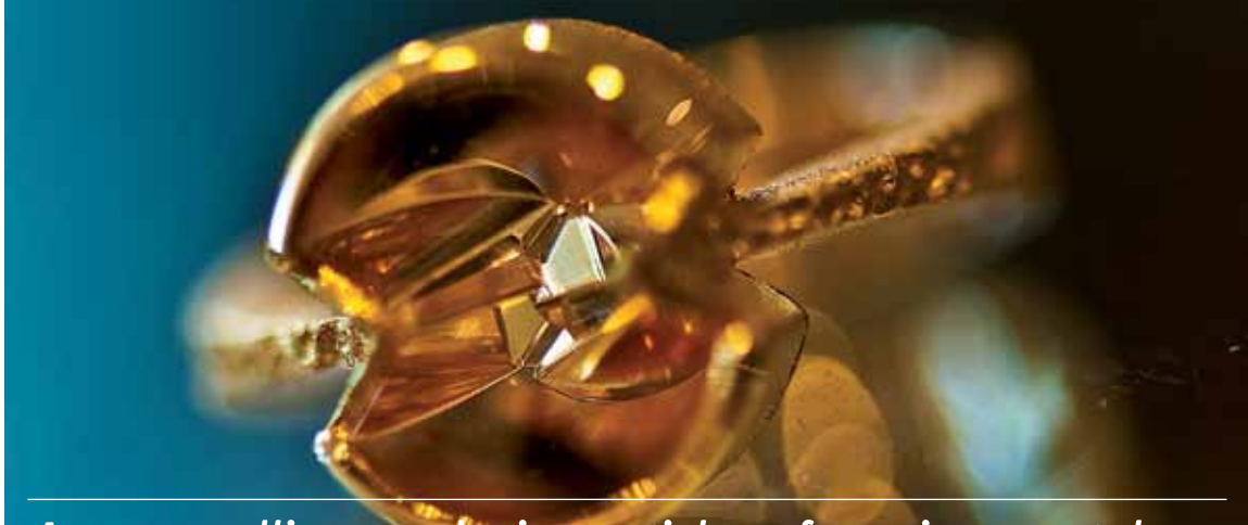
Anyone selling or placing articles of precious metals on the net must be responsible for their conformity.

ALWAYS HAS the responsibility for the articles he sells and the information regarding them. The seller must ensure that the product not only fulfils the requirements laid down by the Finnish legislation on articles of precious metals but also meets other regulations prescribed in trade legislation. The retailer must also know the limitations applying to the use of nickel in jewellery. The Finnish responsibility mark, duly registered with Tukes, helps in ascertaining the party responsible for the product.